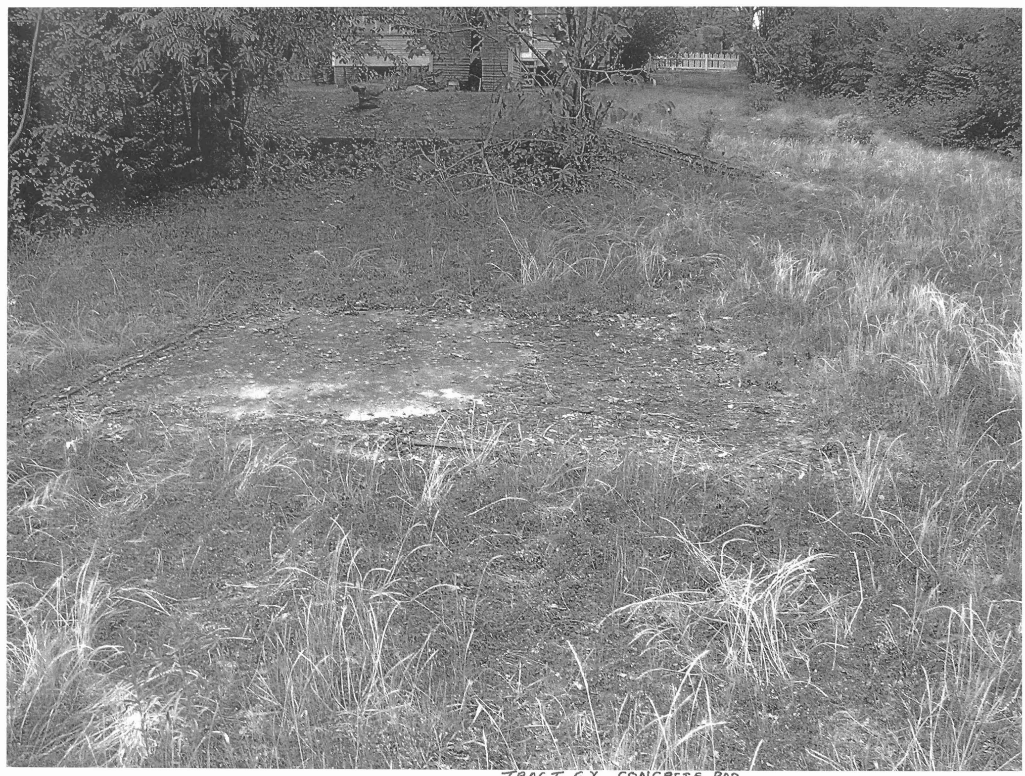
TRACT GX CONCRETE PAD