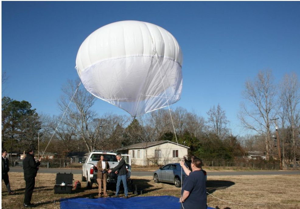
Figure 5. Tethered Helium Balloon Setup

windy, more people will be needed, which is why calm days are strongly recommended. It takes approximately 30-45 minutes to set up. The launch site would have to be large and obstruction free and due to FAA regulations, the tethered balloon cannot be launched within 5 miles of an airport.