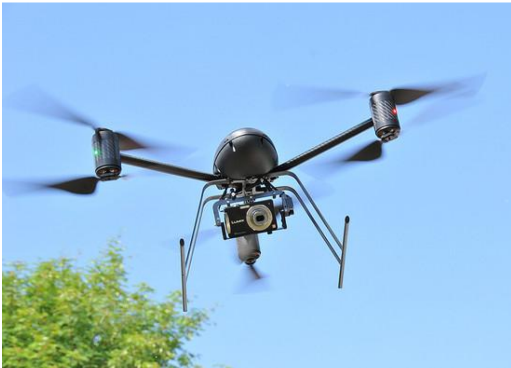
Figure 1. Unmanned Aerial Vehicle

2012. It includes important provisions on the integration of unmanned aircraft systems (UAS) into the national airspace system.