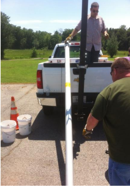
Figure 6. Setting Up Pole for Placement