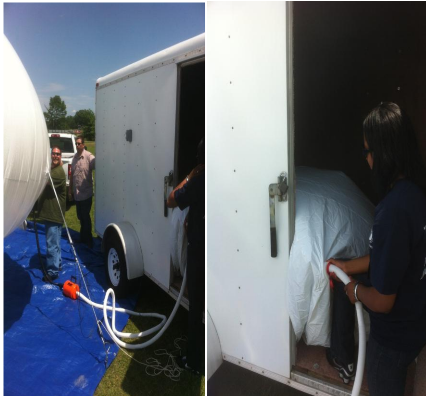
Figure 11. Transferring Helium from Balloon to Bladder

All interior surfaces of the trailer were covered in carpet to keep from puncturing the bladder. By pumping helium out of the balloon and into the bladder at the end of the day, the helium could be stored and re-used for subsequent launches (Figure 11). However, attempting to save the helium would also require another vehicle to haul the trailer.