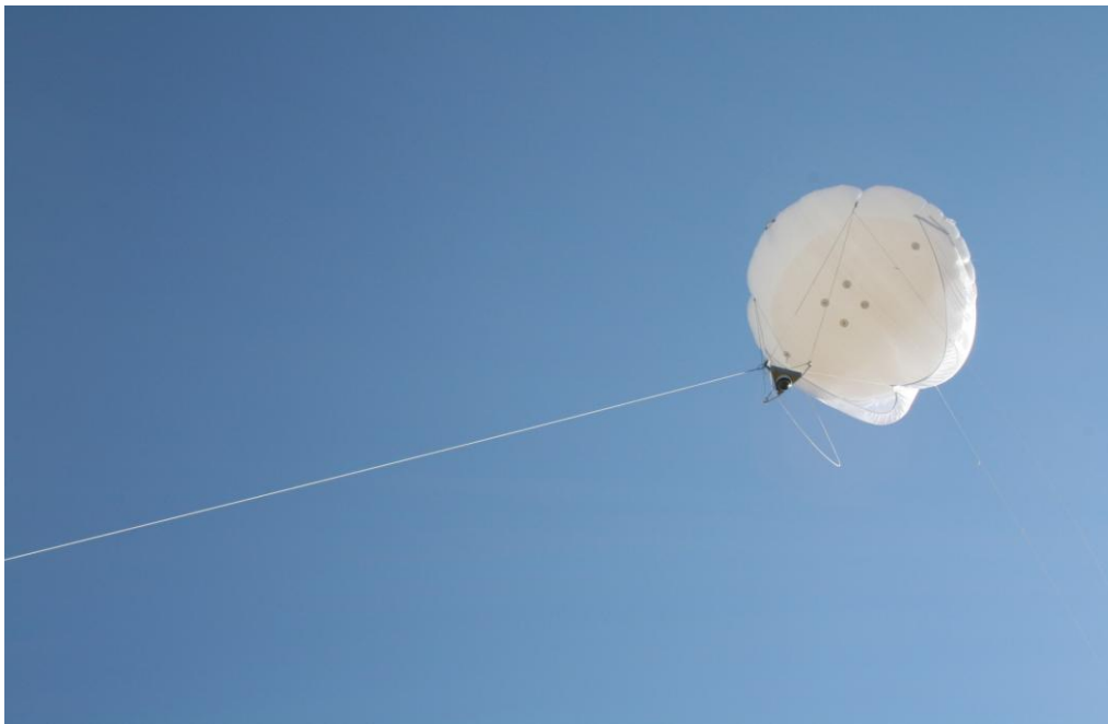
Figure 4. LTAS Aerostat Surveillance Launched