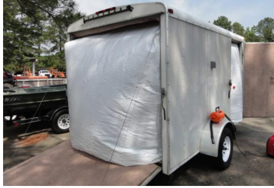
Figure 12. Helium stored in bladder