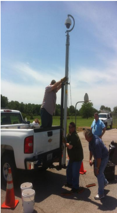
Figure 8. Securing the Mast