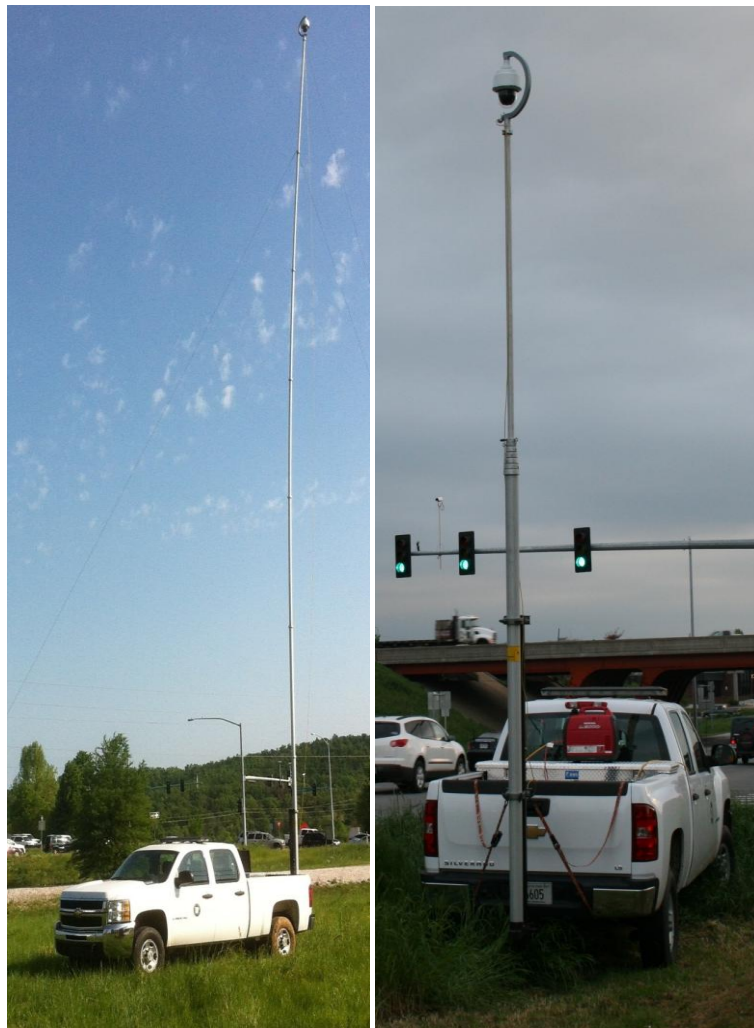
Figure 2. LTAS Mast Surveillance

trailer tilt-over. The mast extension options are either belt or pneumatic. Organizations such as US Border Patrol, US Army or US Marines use belts masts because of its advantage of low maintenance in high-dust environments. Pneumatic mast models are used by highway departments for traffic monitoring, forestry services, first responders and police. Pneumatic models are lighter weight and are typically used when heights exceed 50 feet.