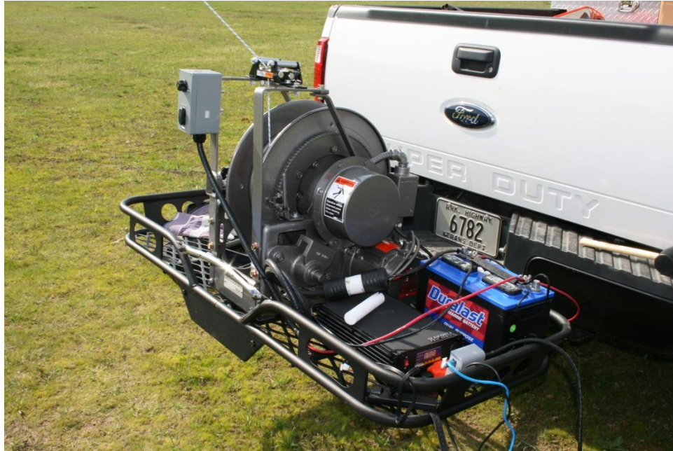
Figure 3. 12 volt DC electric winch