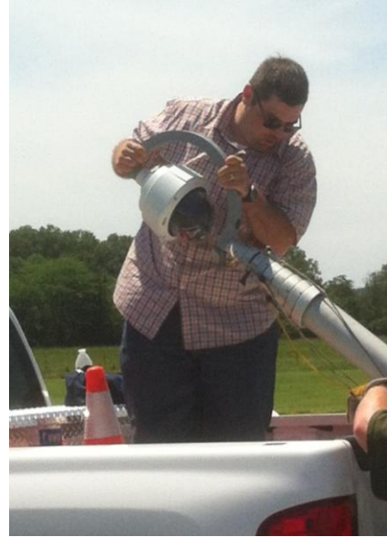
Figure 7. Mounting the camera to the pole