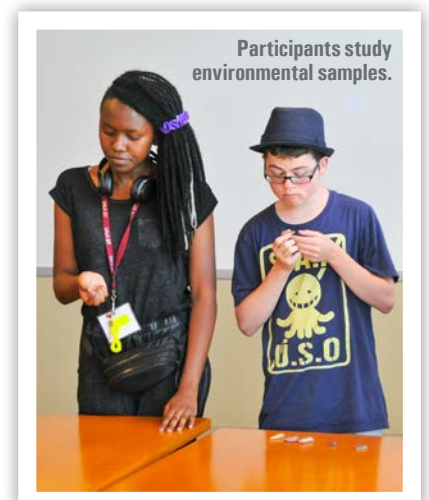
Participants study environmental samples.