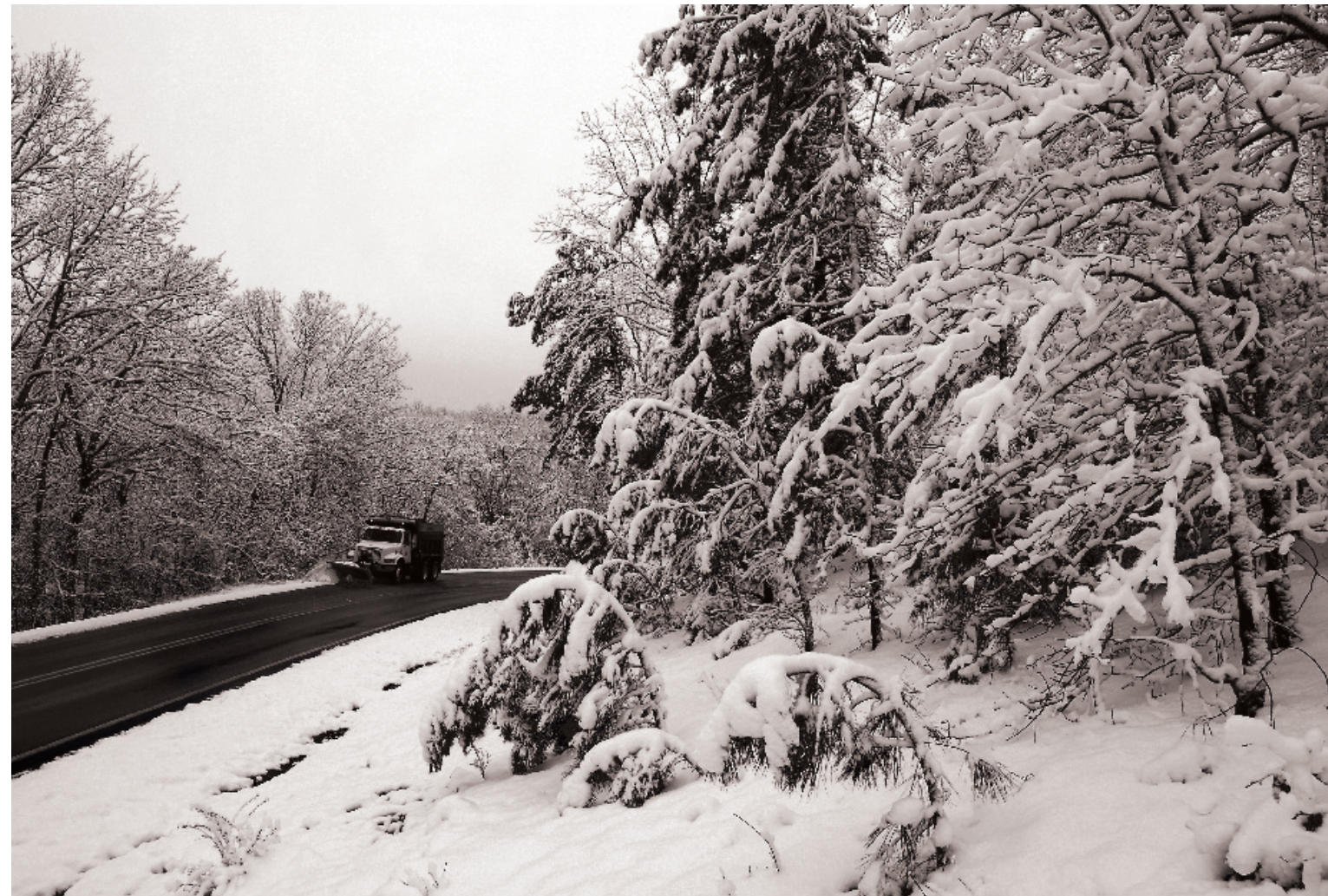
AHTD crews worked around the clock to restore roadways to safe driving conditions after record amounts of snow fell March 4th, 6th and 7th. This truck is plowing excess snow from Highway 95 in Conway County.