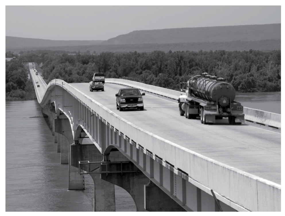
Highway 109 Bridge over the Arkansas River at Clarksville.