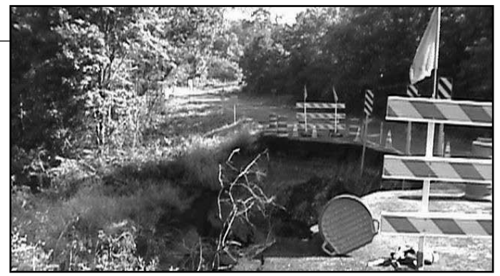
Slope damage to Highway 7 near Pelsor, where seven inches of rain associated with Hurricane Gustav fell.

Receding waters have allowed AHTD workers to assess any damage there may have been to roadways, culverts and