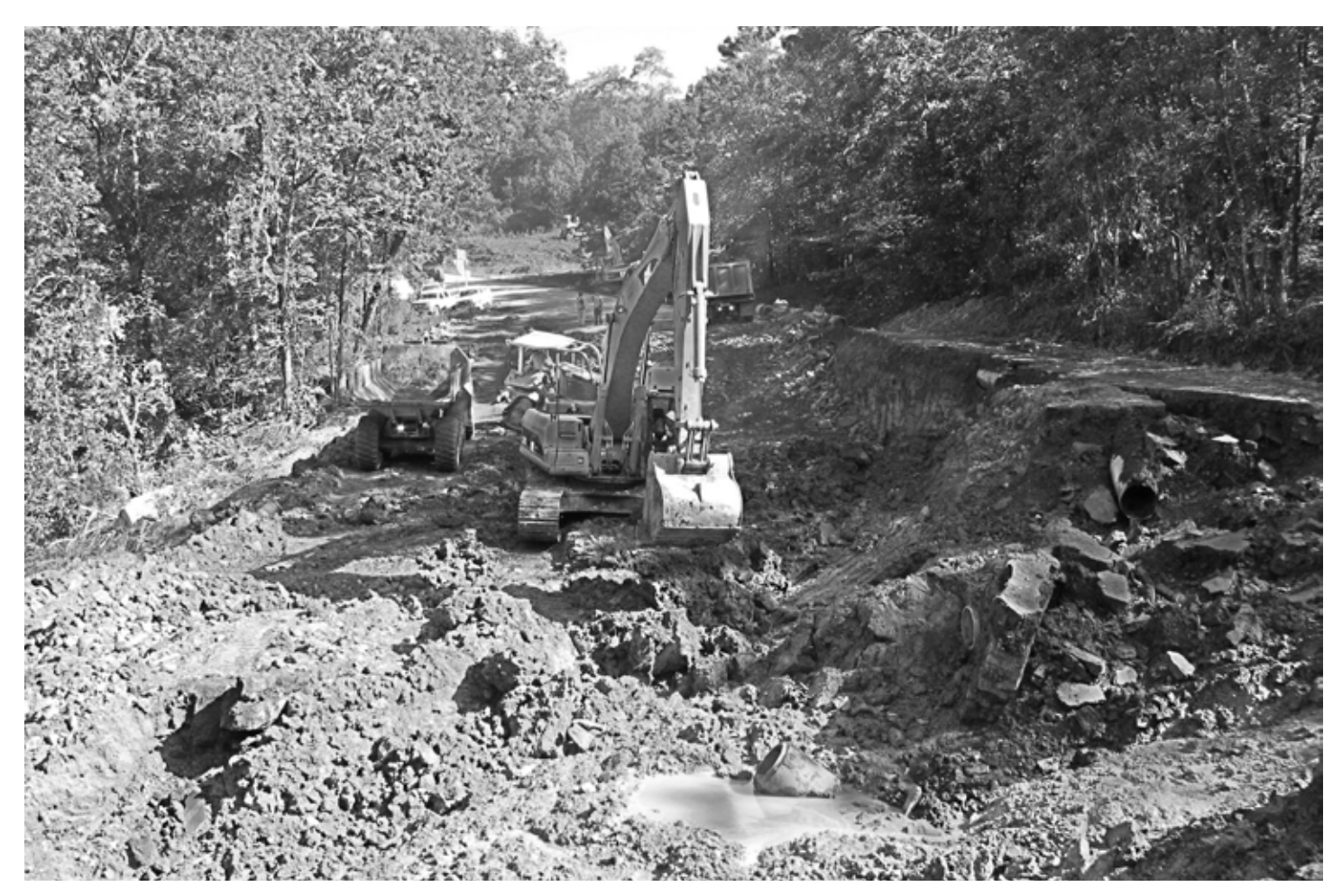
Work underway to repair Highway 7, south of Pelsor.

As if Gustav wasn't enough to deal with, Hurricane Ike followed in its footsteps just one week later. Ike entered the state as a tropical storm and deteriorated to a tropical depression just hours later. Though the storm cut power to over 275,000 Arkansans and spawned a few tornadoes, there were fewer reports of flooded highways with Ike. Flooding would have been worse had Ike not moved through the state so quickly.