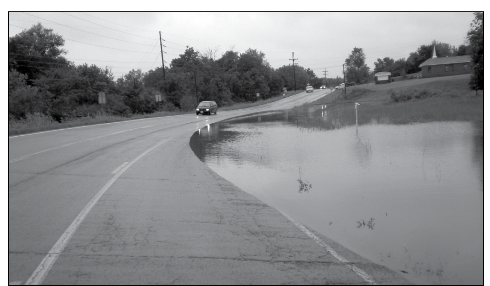
The northbound lane of Highway 71 at Mansfield is overtaken by rising water.

A section of Highway 7 near Pelsor, in Pope County, was closed to through traffic on September 4th due to slope damage. The same location suffered slope damage in March of this year when flooding left damaged highways in 32 counties. Crouse Construction Company of Harrison, Arkansas, was awarded a $492,948.72 contract in August to make repairs to Highway 7. (See FLOOD, Page 6)