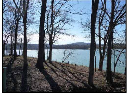
Figure 1. Lake Sequoyah Park

After we do an evaluation such as this, some Section 4(f) impacts can be recognized as de minimis , which means relatively minor. We will present information to prove that there are only minor impacts to Lake Sequoyah Park. We can have a de minimis finding on projects that meet the conditions shown in Table 1.