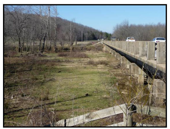
Figure 6. Typical Land to be Acquired from Lake Sequoyah Park (South Side Hwy. 16)

The roadway improvements will require the acquisition of 3.1 acres of park property. The portion of Lake Sequoyah Park that will be used by the road construction is located along Highway 16, as shown in Figure 6. No recreational activities occur on the property to be taken for the road project. Figure 6 shows the area of Lake Sequoyah Park that will be affected. Impacts to the park that result from highway construction will include: